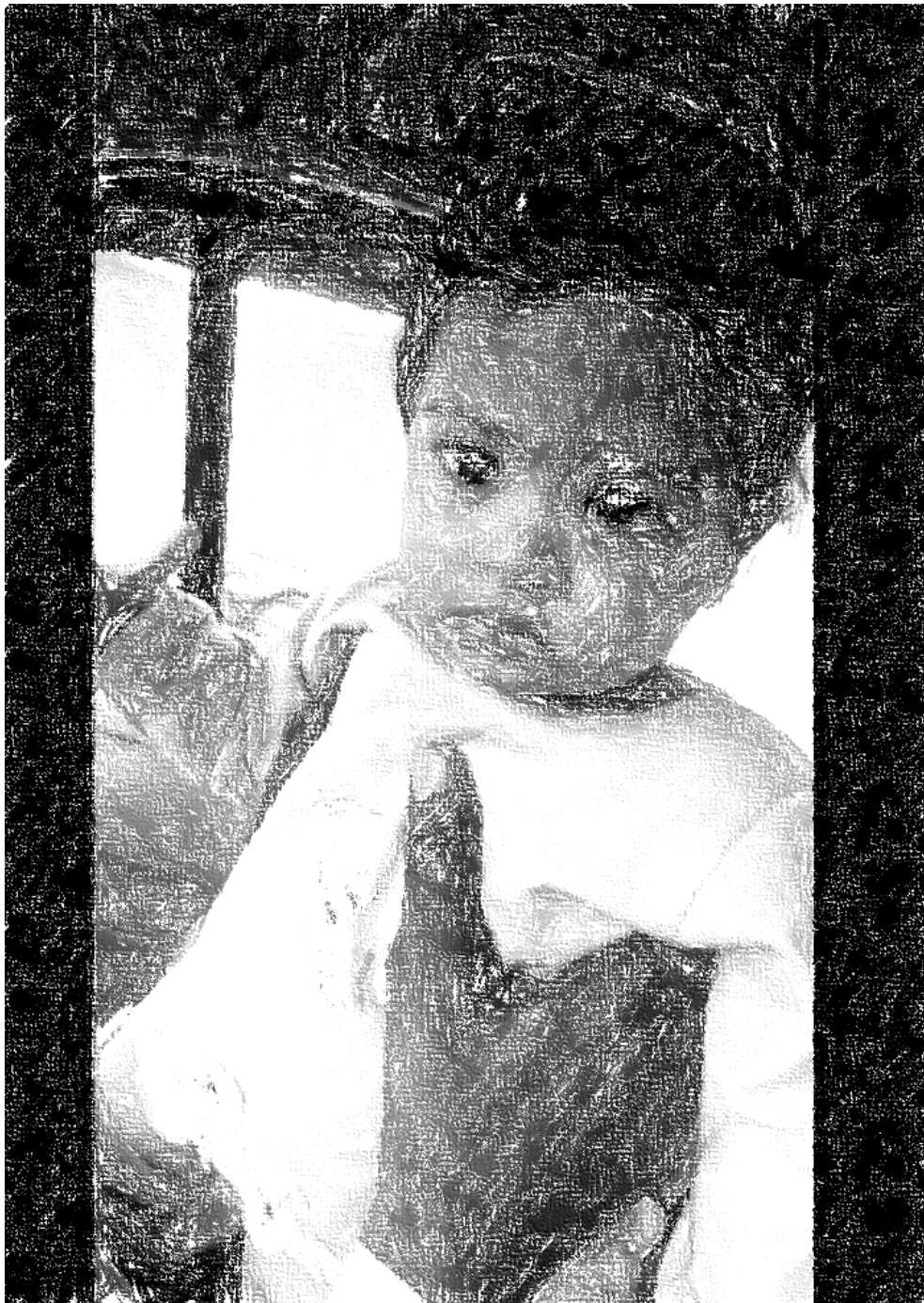
Story of the mother

The Set Free Movement sees the image of God in every child and helps him/her to live a life of respect and dignity.