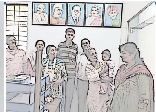
Child with CWC